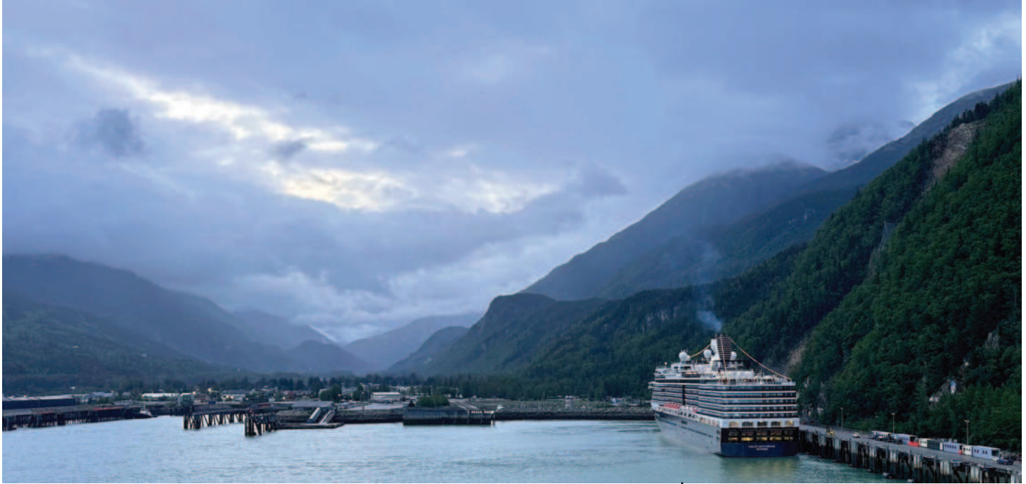
Above: Pulling into Skagway Harbor