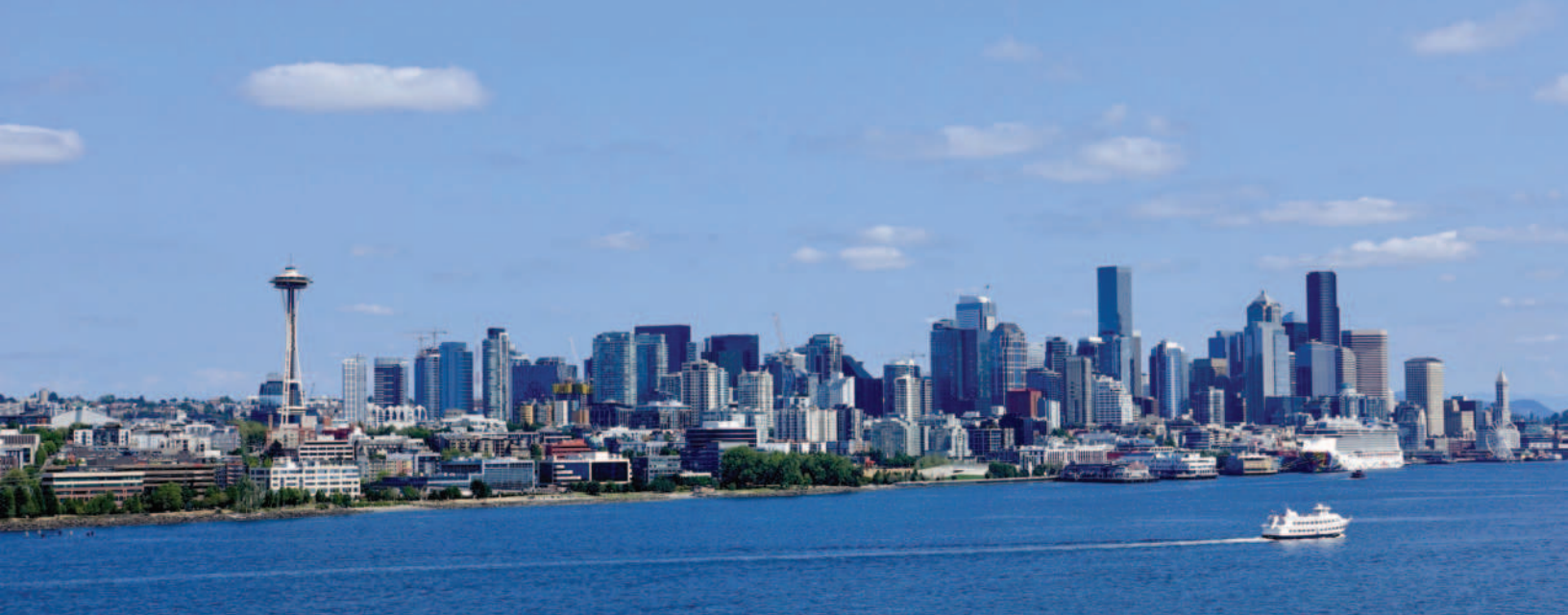
Above: Glistening Seattle - Let the adventure begin!