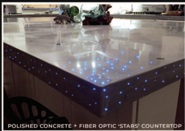
POLISHED CONCRETE + FIBER OPTIC 'STARS' COUNTERTOP

EXOTIC & RECLAIMED WOOD, STONE, CONCRETE + MORE COUNTERS, FIREPLACES, PATIOS, WHATEVER YOU WANT!