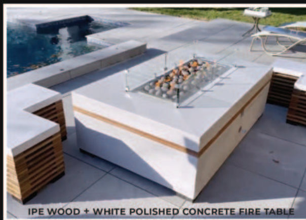
IPE WOOD + WHITE POLISHED CONCRETE FIRE TABLE