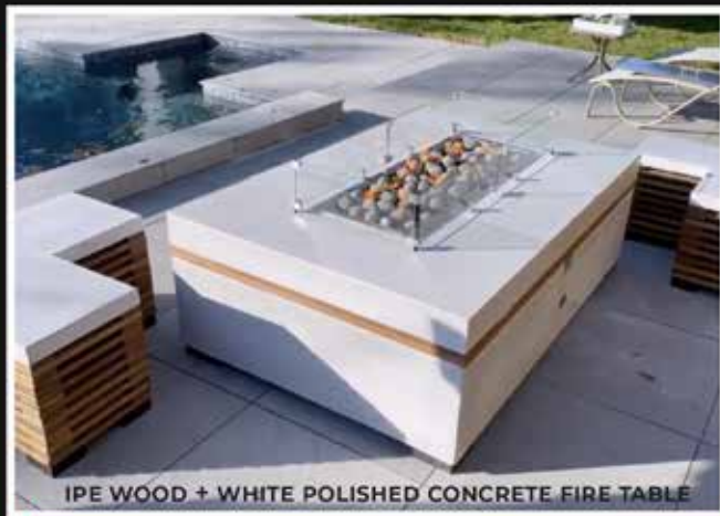
IPE WOOD + WHITE POLISHED CONCRETE FIRE TABLE