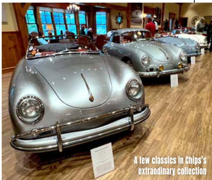
A few classics in Chips's extraordinary collection