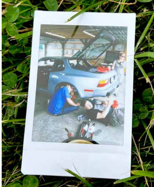
Top left: Sean on Turn 13