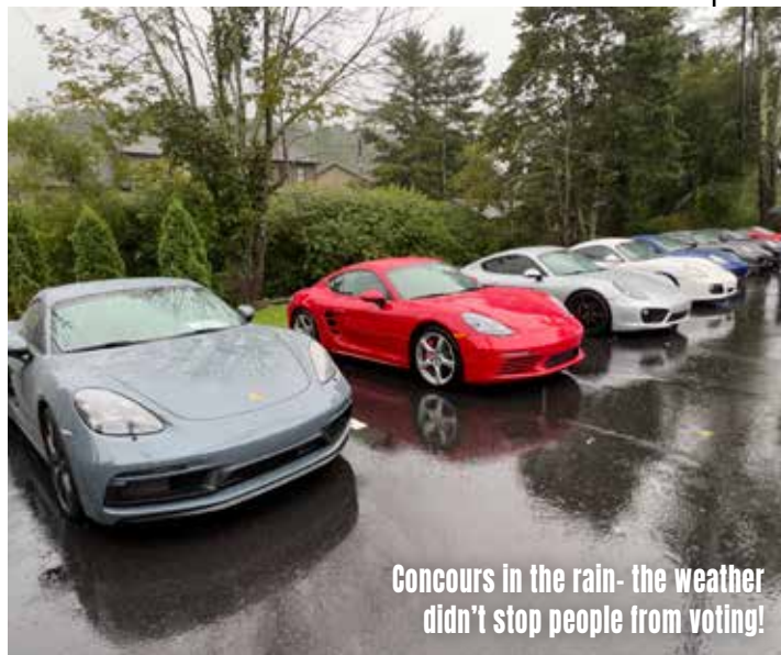
Concours in the rain- the weather didn't stop people from voting!