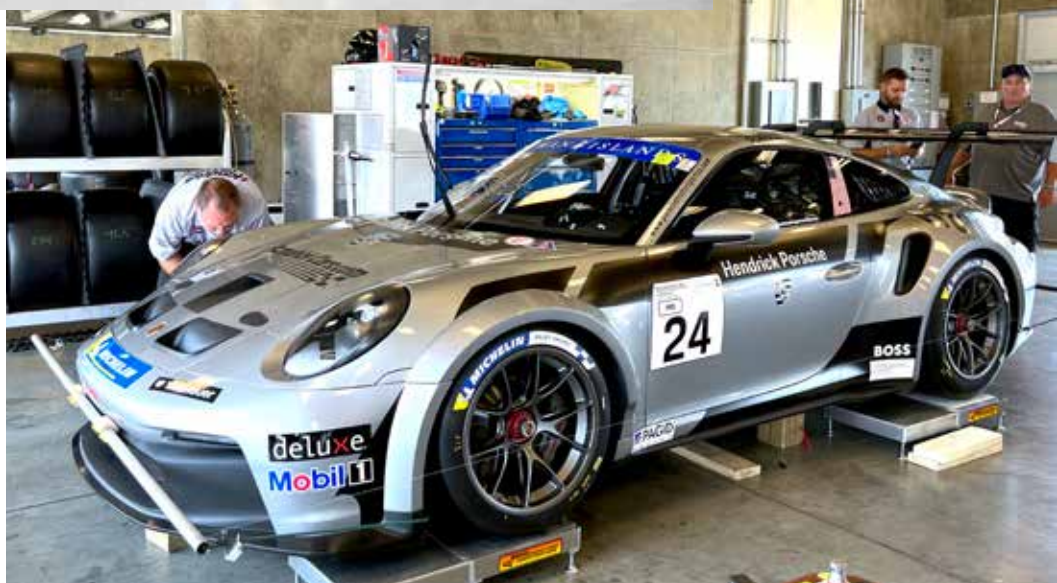
Below: NASCAR legend Jeff Gordon's pit crew doing a string alignment

Opposite: "Mint Green" cookies & cream pop from Pretty Cool