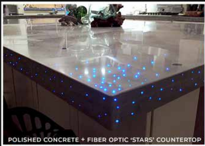
POLISHED CONCRETE + FIBER OPTIC 'STARS' COUNTERTOP

EXOTIC & RECLAIMED WOOD, STONE, CONCRETE + MORE COUNTERS, FIREPLACES, PATIOS, WHATEVER YOU WANT!