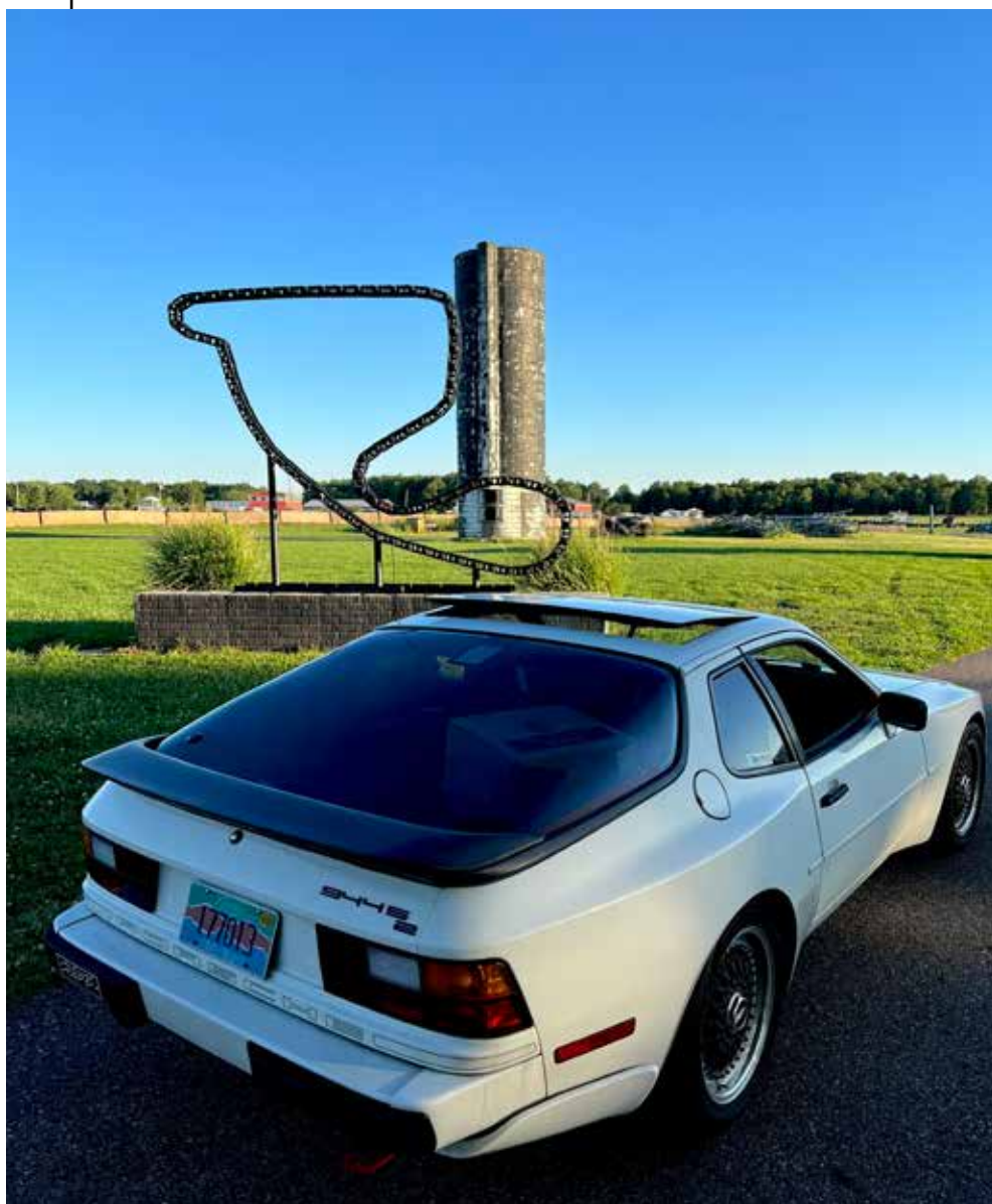
Left: track sign

drive on, even the interstates are (somewhat) twisty. A quick stop in Murphy, NC to help fix a young high school girl's first car, a 944, and another pit stop at the legendary 944Barn rounded out my trip. Passing through Atlanta on my way home, I exchanged parts with my friend, checked up on a front wheel bearing, and discovered an exhaust crack in my cat pipe, which luckily I got fixed with somebody else's help before it broke apart. The exhaust broke in the same way that my first 944 did. I've learned—on this next exhaust, I'm going to preemptively reinforce those welds to prevent it from failing on me.