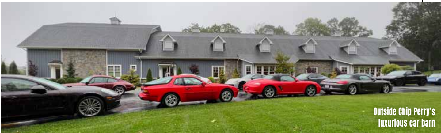
Outside Chip Perry's luxurious car barn