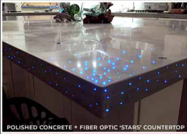
POLISHED CONCRETE + FIBER OPTIC 'STARS' COUNTERTOP

EXOTIC & RECLAIMED WOOD, STONE, CONCRETE + MORE COUNTERS, FIREPLACES, PATIOS, WHATEVER YOU WANT!