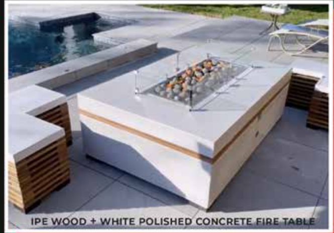
IPE WOOD + WHITE POLISHED CONCRETE FIRE TABLE