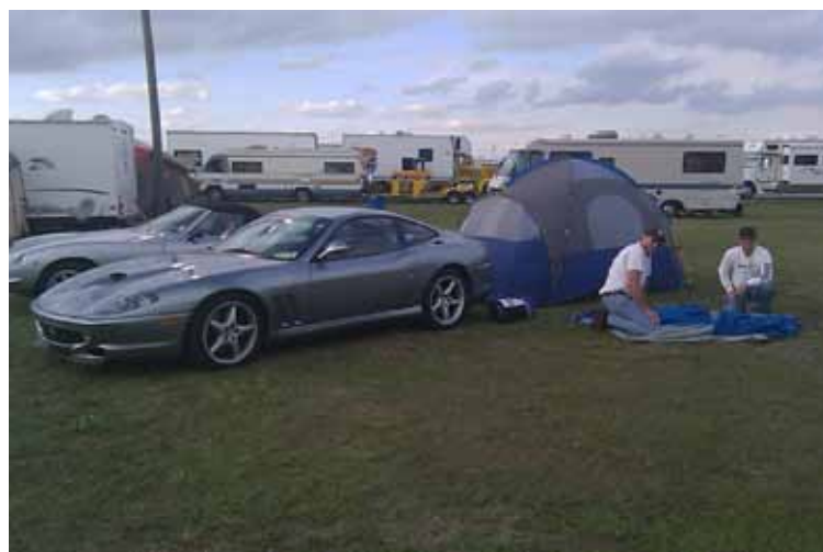
Ferrari drivers "roughing it" at Sebring

Learn more so you can earn more. www.RetireYourCD.biz or 407-835-9858 for a free report.