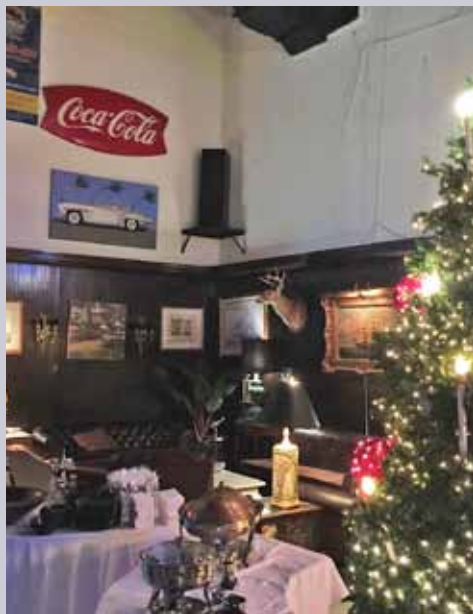
Holiday party at South East Performance.