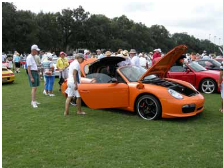
Concours judges inspecting a limited edition Boxster

I found the Concours preparation area inside staged in the exhibition hall at the Savannah Convention Center. Inside this prep area, was a variety of price-less and interesting Porsche vehicles. Everything was there from the earliest of 356's (way better than factory fresh) to the latest Panameras. People were at work with toothbrushes, Q-tips, and different gauges