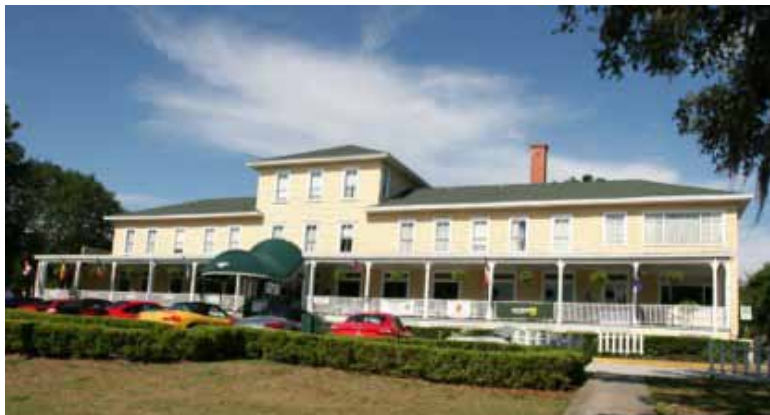
Historic Lakeside Inn Mt Dora