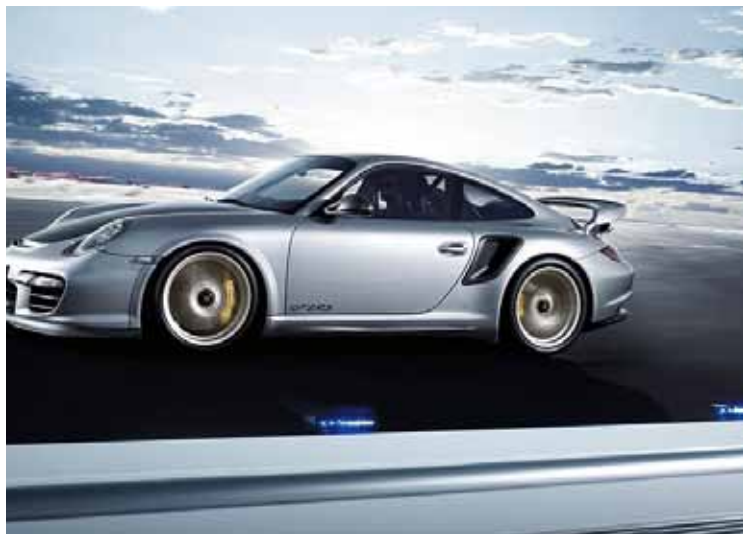
One of Porsche's current models, the 620 Highly Efficient 911 GT2 RS - The Most Powerful Street-Legal Porsche of all Times

In March of this year, Porsche already achieved impressive ratings in the J.D. Power Study on used car quality, ranking number one in the overall ratings. The Initial Quality Study surveys the satisfaction of more than 82,000 US customers in the first three months of purchasing their new cars. A total of 236 car models are rated according to 228 criteria that are arranged in categories like driving experience and engine performance.