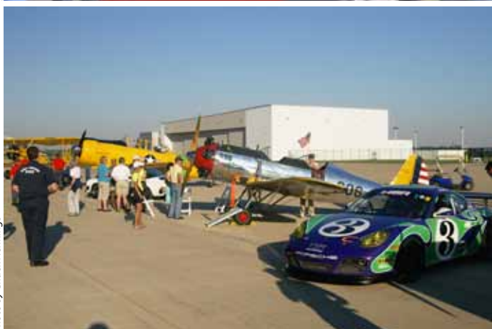
Welcome Party at DuPage Airport Hanger and Displays On Tarmac