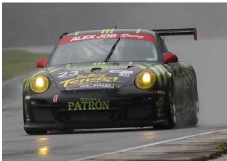
Alex Job Racing #23 at Rainy Lime Rock