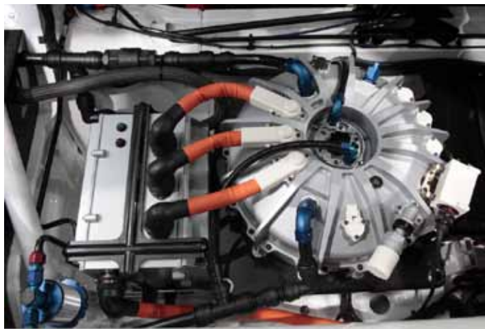
Top - 911 GT3 Hybrid at Nuburging 24