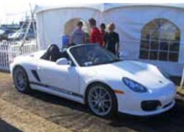
New Porsche Spyder featured at Porscheplatz

Over 175 Porsches filled the Porsche Corral Saturday, race day at Sebring. Volunteers from several Clubs, manned the function headed by Jennifer Barrows, Zone 12 Representative. Friday, there were parade laps, driver autographs, presentations and a Flying Lizard tour. Saturday included raffle drawings and watching the race in the tent on big screen TV.