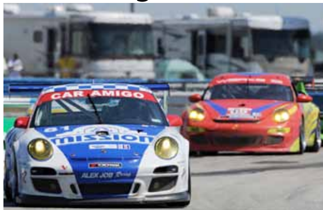
AJR GTC GT3 Cup Porsche

It marked Porsche's second Sebring class victory for the RS Spyder, which made its first 12 Hours start in 2006. Penske Racing won overall in 2008, and Saturday's win by CytoSport was the first time an independent team won in North America with the prototype.