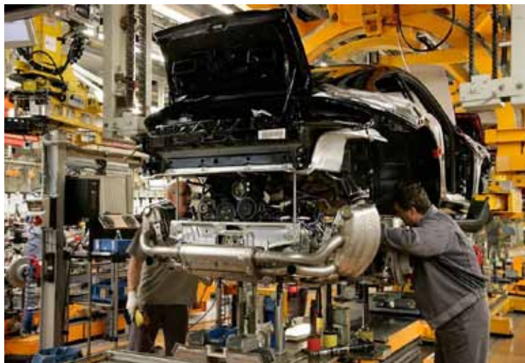
Porsche 911 during assembly in Zuffenhausen