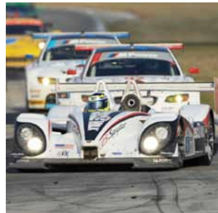
Porsche LMP2 RS Spyder

The fight in GT2 was a fantastic scrap before attrition started to take its toll. Team Falken Tire led early on in its Porsche and had two wheels come off on consecutive laps. The second hit the then-second-place Flying Lizard Motorsports Porsche, which lost three laps in the pits. Corvette Racing's two Corvettes collided in pit lane when one Corvette C6.R tried to leave its pit box and another came in simultaneously. That left the Risi Ferrari and two BMWs to duke it out.