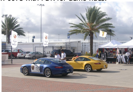
Porsche of Melbourne Welcome Area

A big Thank You also to Porsche of Melbourne for being Title sponsor of this event. They also had new 997s with PDK for demo rides.