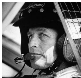
Paul Newman Dies at 83 See Story On Page 5