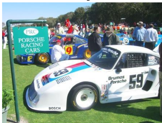
959's Displayed at Amelia Island