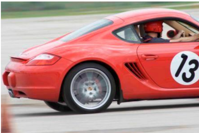
Cayman Zipping Through the Cones