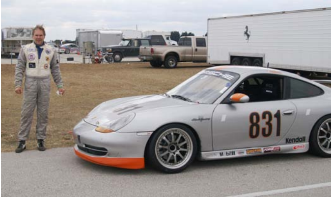
Greg Barrows Sets PB @ Sebring