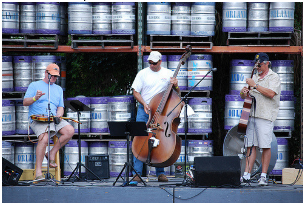
The Band and the Beer