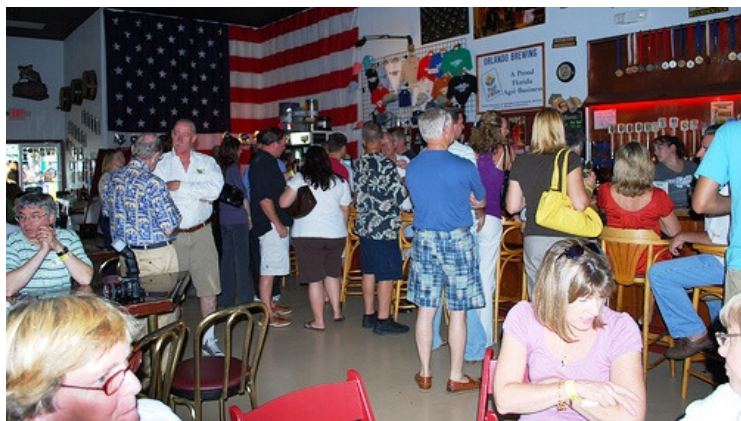
Escaping the Heat and Ordering the Brews