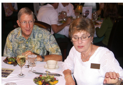
No Photos Please