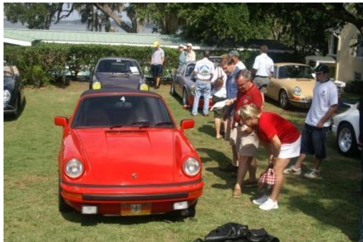
Concours Judges At Work