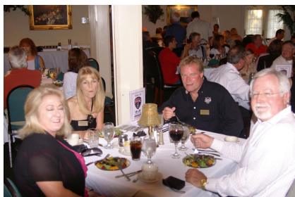
Ready to Dig In