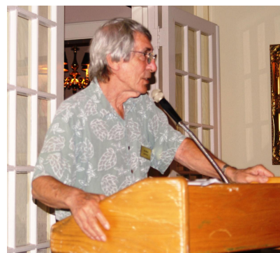
Porsche 917, Ford Escort – Yes, I've Driven them All