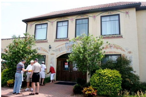
Yalaha Bakery Stop