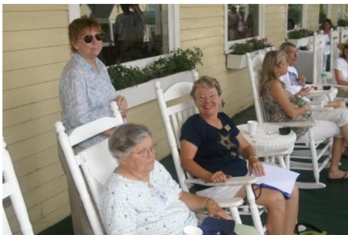
Porch Rockers Enjoy Great Weather