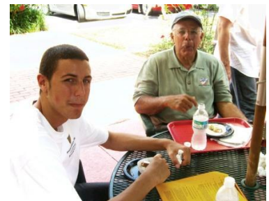
The Ledesma's at Yalaha