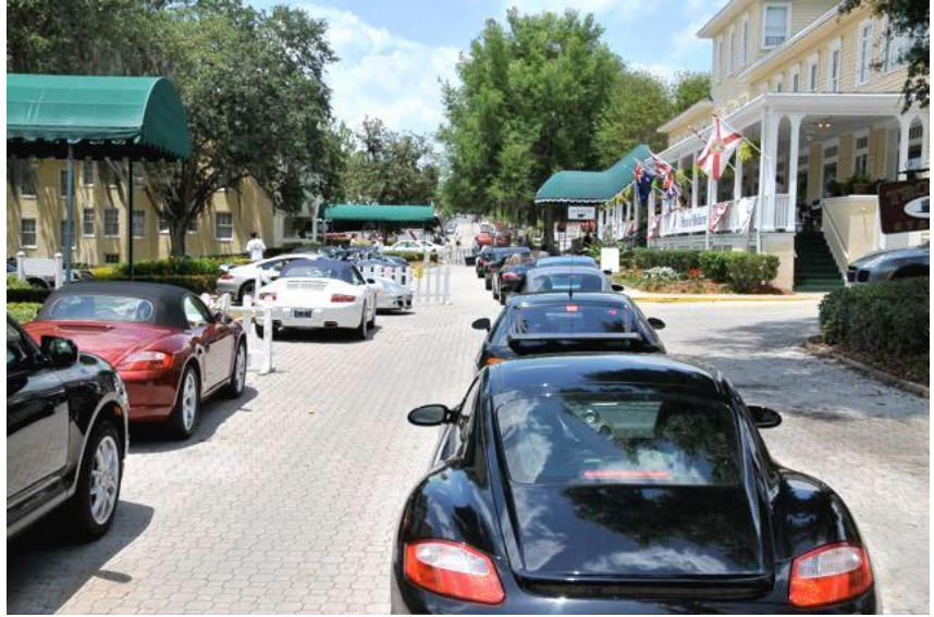
Part of Lineup for Rally