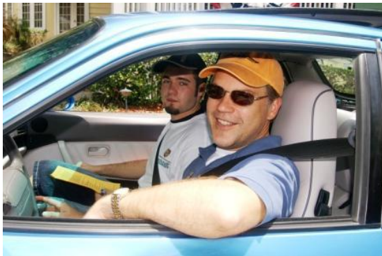
The Barrows Ready to Roll