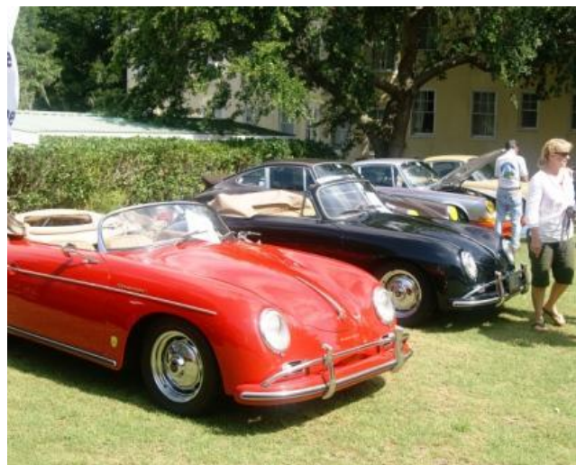
Classic 356's Grace Lakeside Inn Lawn