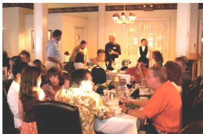
More Beauclaire Room