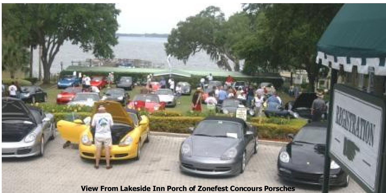
View From Lakeside Inn Porch of Zonefest Concours Porsches