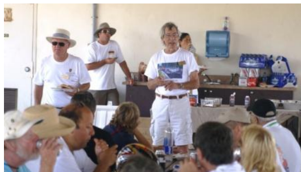
Vic Elford Entertains at Lunch Break