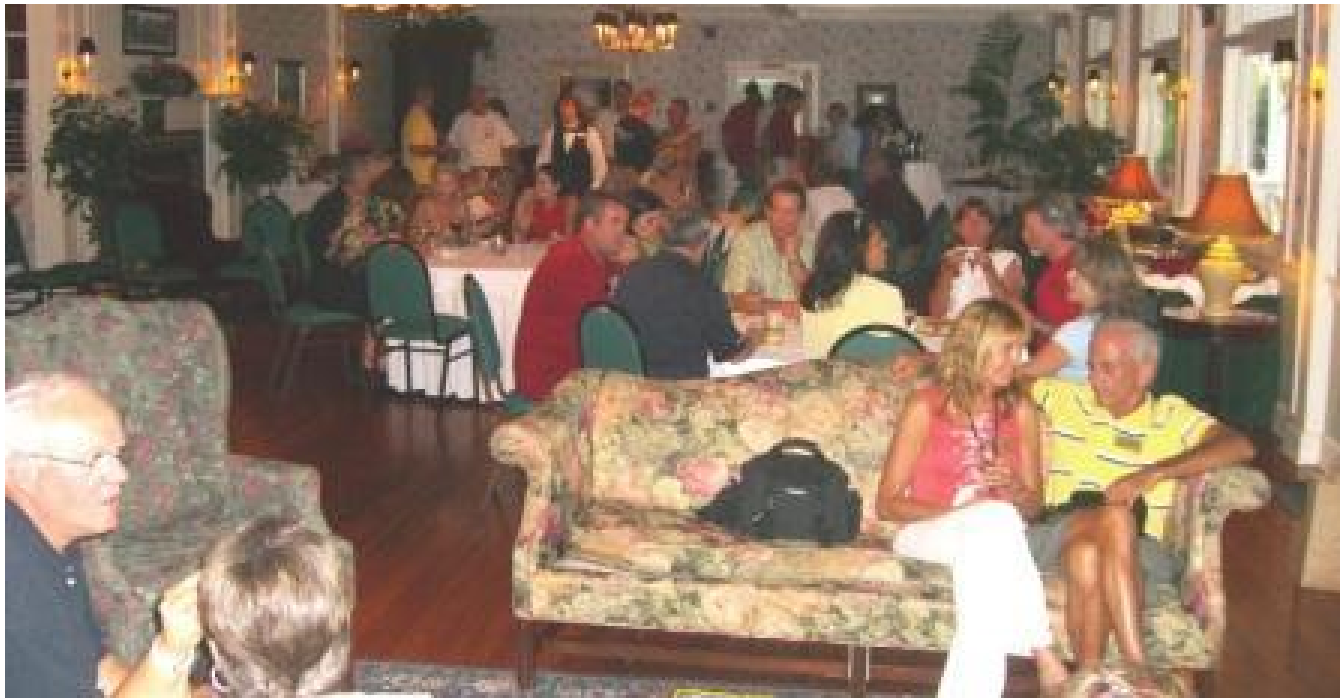
Part of Crowd at Welcome Party