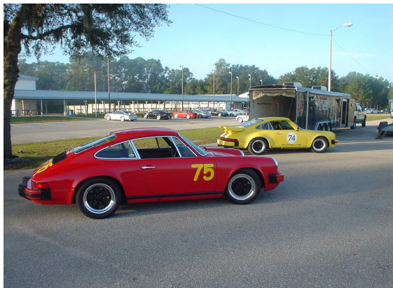
It's not the cars but these are great looking; # 75 belonging to Howard Osterhouse and #74 to George Creamean

The next events are scheduled for January 6 and February 2. Watch the Spiel, the web site and your email for updates. Remember, events can be cancelled by Lake County on short notice.