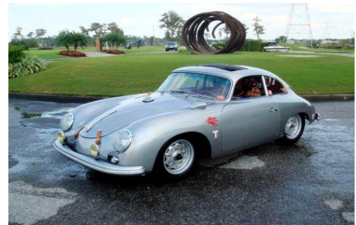
The People's Choice Award Winner!