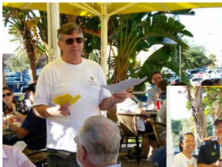
Rally Master Giving Answers at Bahama Breeze