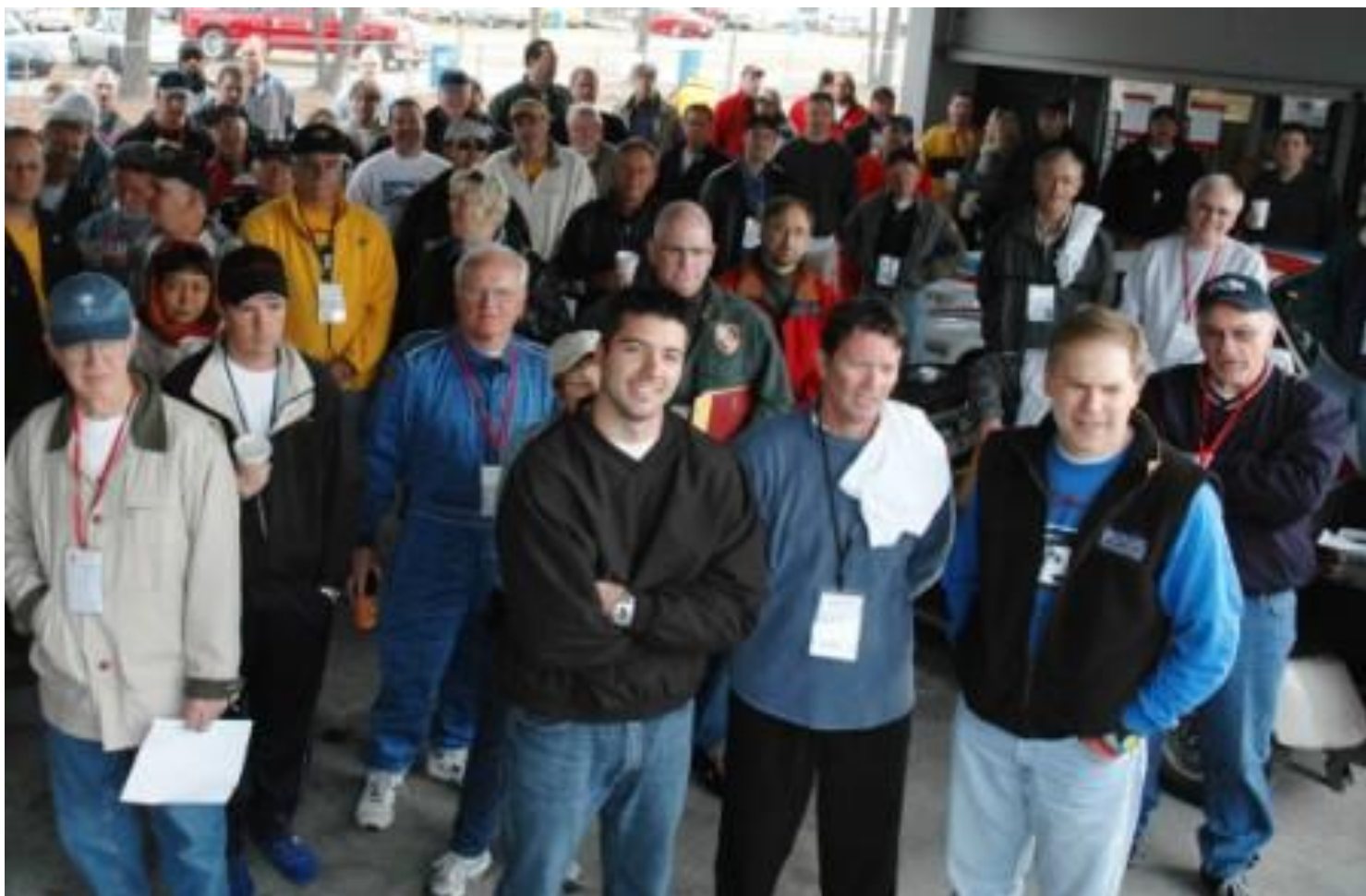
First time and "Veteran" drivers gather for driver's meeting at Roebling Road Drivers Ed Event