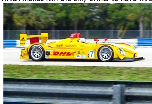
Overall Winner #7 Porsche RS Spyder