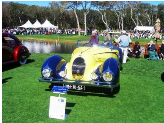
Stunning yellow (body) and blue (fenders) on this 1938 Talbot Lago T 150-C

Bottom line, for the $40 entry fee plus $10 parking, just add Amelia to your list of "must do's" for next year and leave the skydiving or bungee jump for your Bucket List (make those last on that list).