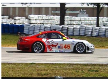
GT2 Class Winner #45 GT3 RSR