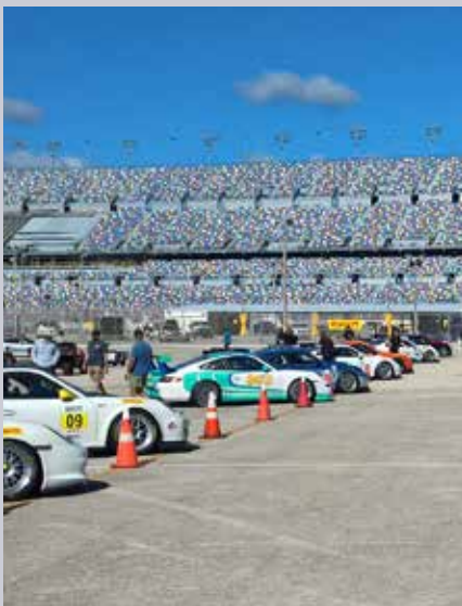
Daytona Club Race