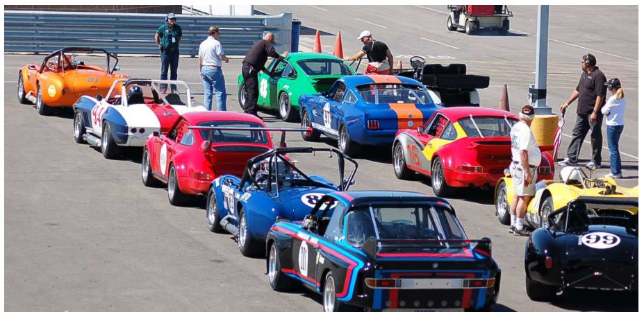
Lineup at Miller Motorsports Park, Utah