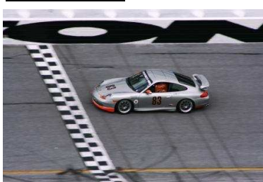
Greg Barrows @ Daytona

Race, watch or volunteer at the OktoberFast PCA race at Daytona International Speedway. The title sponsor, Porsche of Melbourne, will host OktoberFast at Daytona International Speedway 10-12 October. We'll run the same 3.56 mile road course that is used for the Rolex 24 Hours of Daytona , utilizing the infield road course and the high banks of Daytona!