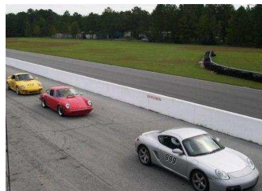
Roebling Road Lineup at Track Entry

Our final Driver's Education of 2008 is just a few weeks away. If you haven't already registered, head over to the online registration website, www.clubregistration.net and get registered before your run group is full. Like our February DE, this event is being held at Roebling Road Raceway, a 2.02 mile road course near Savannah, GA. The course's technical layout, combined with ample runoff areas for added safety, makes Roebling an excellent learning track for both novice and experienced drivers. And being close to historic Savannah and shops, there are activities for the whole family.